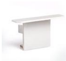
end cap LARKO without hole (24008)