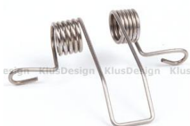
spring KMA (00838)