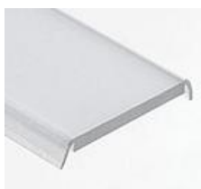
cover type HS22 frosted (17011) transparent (17022)