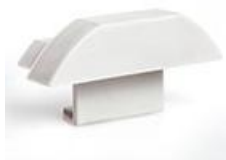
end cap LESTO without hole (24008)