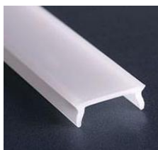
cover type K/KA-BIS frosted (1547/17071) transp. (1548/17072) cover type LIGER frosted matte (17031)