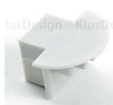
end cap without hole (1438) with hole (1447)