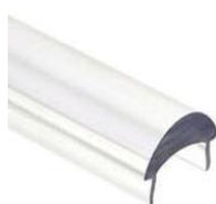
cover type S transparent (00220)