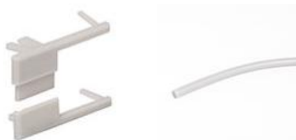
end cap KRAV 56 (24033) KRAV 810 (24028)